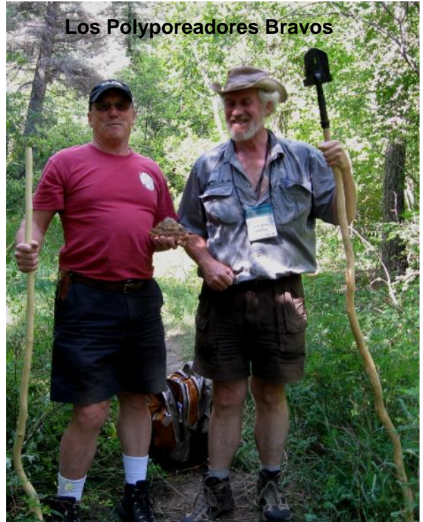
Los Polyporeadores Bravos

Regardless of the what the future has in store for the NMMS Newsletter, I will continue to maintain the website www.mycowest.org and will continue to provide news and pertinent information via that medium.