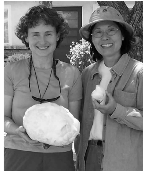
Someone said we don't have a photo of Calvatia booniana. These specimens were collected in May 2004.

Next Meeting: Saturday, May 5, 2007 Santa Fe Public Library, LaFarge Branch (See driving directions page 4)