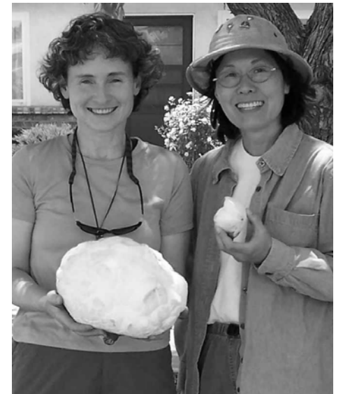
Someone said we don't have a photo of Calvatia booniana. These specimens were collected in May 2004.