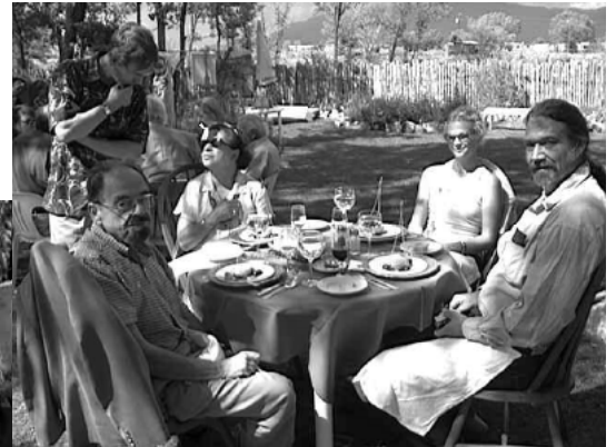
Outstanding food and drink a beautiful setting and friends to share it with