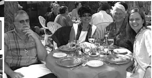
What more could one ask for!