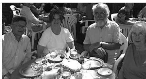
Smiles and good cheer abound!